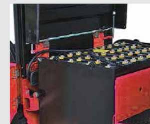
The battery cover can be fully opened, the design is easy for maintenance