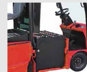
Side change battery design is convenient for changing battery