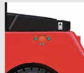
Forward/Reverse inching switch and emergency switch are mounted on the left rear, them make the hook easy and safe